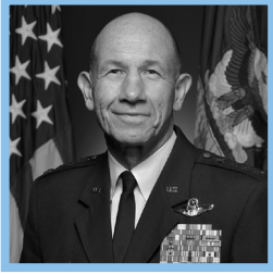
AIR COMBAT COMMAND 1:10PM General Holmes