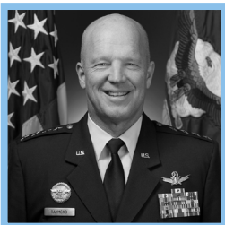
AIR FORCE SPACE COMMAND 10:15AM General Raymond

Gen Raymond will be the U.S. Air Force's FY19 space superiority investments, highlighting ongoing developments and future investments to ensure we can protect and defend our space assets and maintain space superiority.