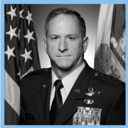
AIR FORCE CHIEF OF STAFF 9:30AM General Goldfein