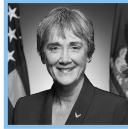
SECRETARY OF THE AIR FORCE 3:00PM Dr. Heather Wilson